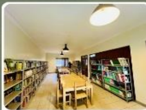
BUGANDA LIBRARY & ARCHIVES CENTRE

At the Buganda Heritage and Tourism Board premises, It's not just OFFICES