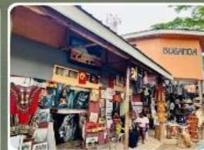
BUGANDA CRAFTS VILLAGE