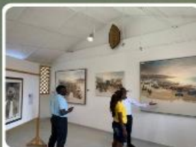
BUMU ART GALLERY