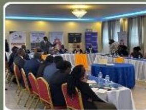
BUGANDA CONFERENCE CENTRE