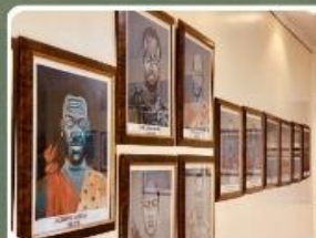
BUGANDA PICTORIAL GALLERY